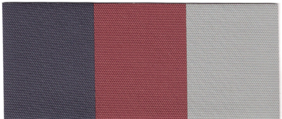
Navy Blue NT7747